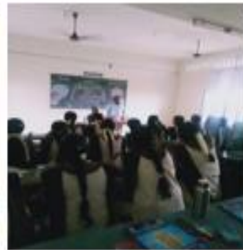
Students received certificate for online courses